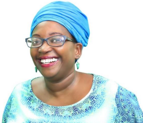
Stella Nyanzi Scholar of Writers-in-Exile Program, PEN Zentrum Deutschland

Unconventional, anti-establishment, and a feminist activist against gender oppression and patriarchy, Stella Nyanzi wears many hats. She advocates for human rights, gender justice and queer rights. She is also an opposition politician in Uganda.