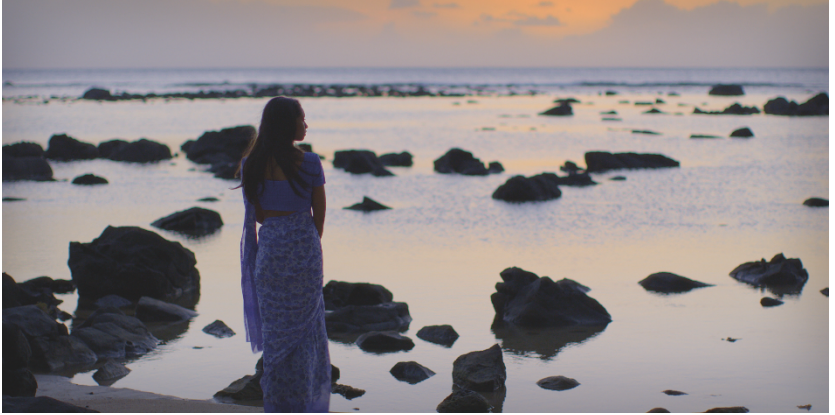
(2019, English, 70min)